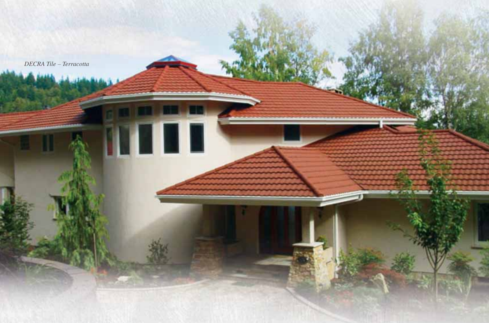
DECRA Tile – Terracotta

Offering the beauty and style of Mediterranean tile and the lightweight components of stone coated steel, a DECRA Tile roof adds a unique elegance to any home. With a long-standing reputation for performance, longevity and versatility, DECRA Tile has been an ideal alternative to traditional tile products for over 50 years. From traditional Terracotta to an atypical Arctic Blue, a wide variety of colors is available.