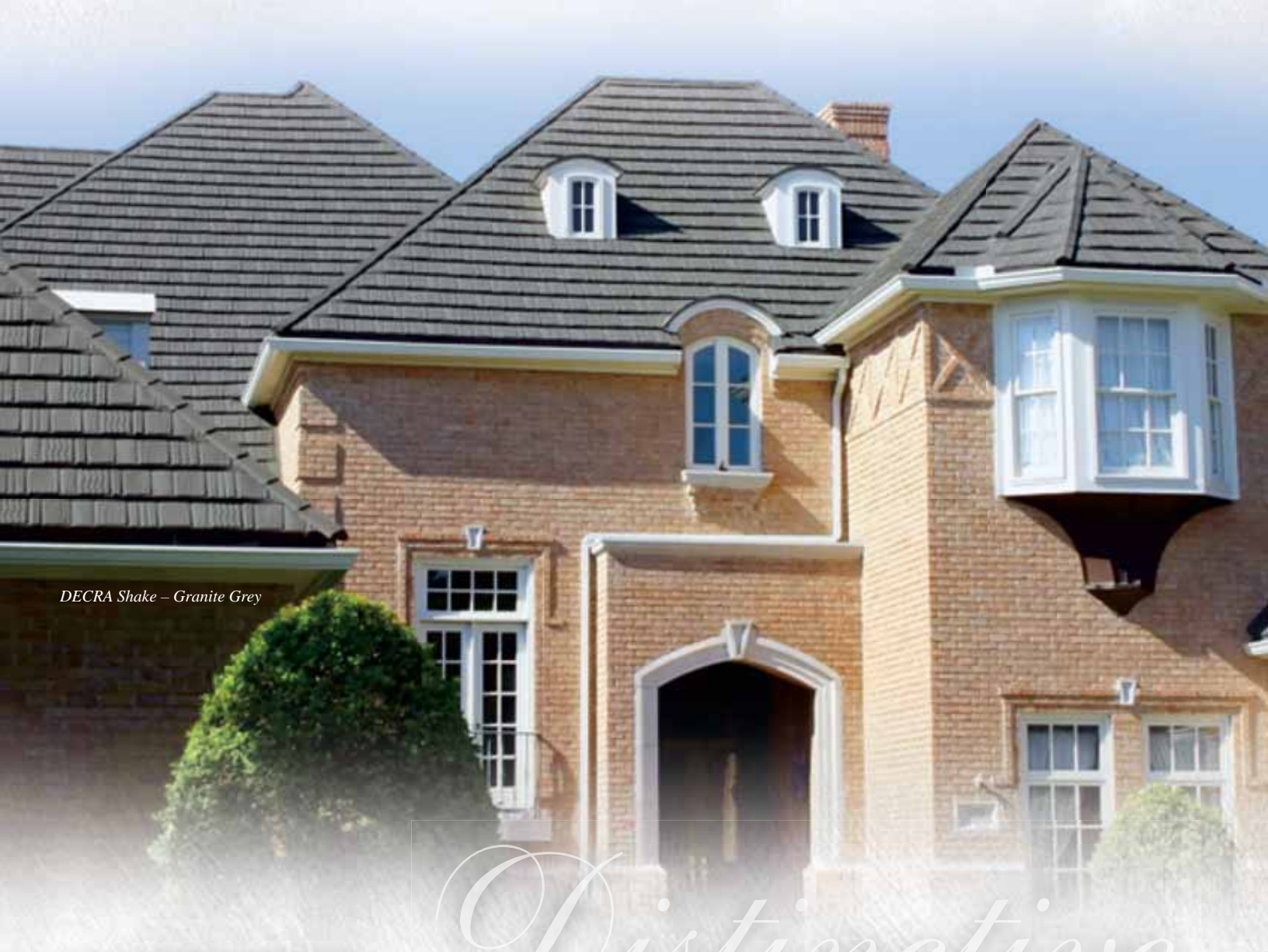
DECRA Shake – Granite Grey