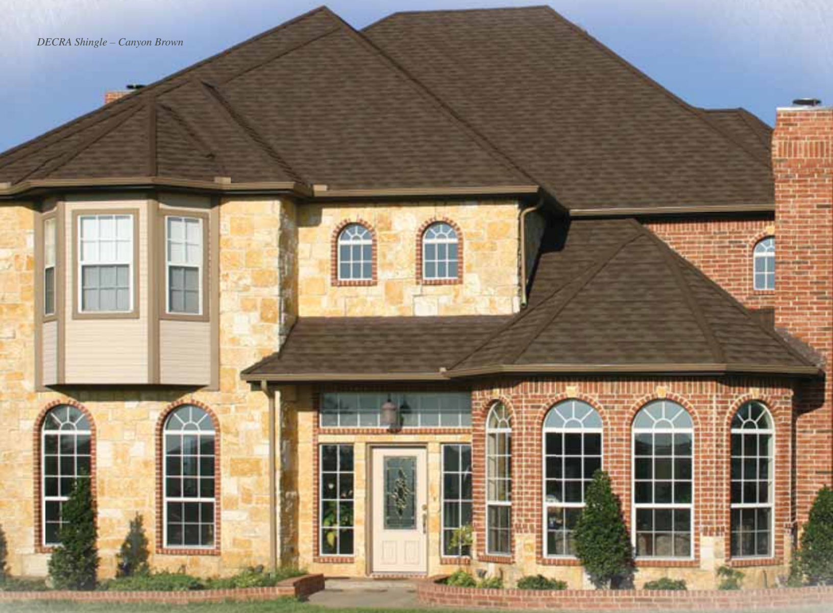
DECRA Shingle – Canyon Brown

If you are looking for the upscale design of a dimensional shingle, DECRA Shingle is the choice for you. DECRA Shingle offers a classic look that features a traditional distinctive style, reinforced with the strength and longevity of steel. Available in a variety of natural earth tone colors, these colors incorporate a subtle natural shadow, which enhances the richness and detail of the roof.