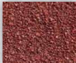
Garnet (Tile Only)