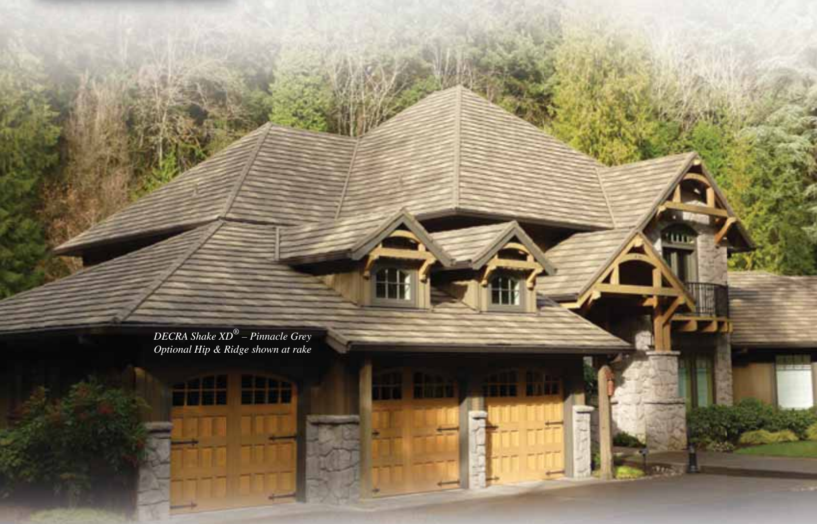
DECRA Shake XD® – Pinnacle Grey Optional Hip & Ridge shown at rake

DECRA Shake XD® offers the classic beauty and architectural detail of a thick, rustic, handsplit wood shake combined with the superior performance and longevity of steel. Shake XD® is lightweight, durable and provides safety and security beyond other roofing products. The steel Shake XD® panels support foot traffic and will not crack, split, curl or break like traditional wood shakes.