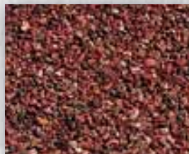
Terracotta (Tile Only)