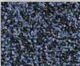
Arctic Blue (Tile Only)