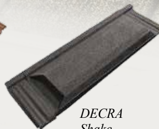
DECRA Shake Panel Vent