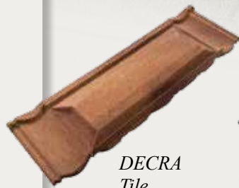
DECRA Tile Panel Vent