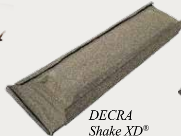
DECRA Shake XD® Panel Vent