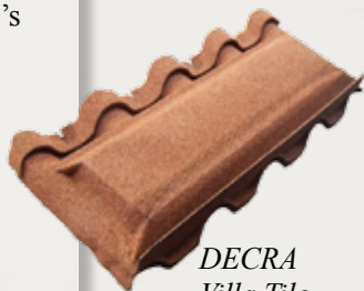
DECRA Villa Tile Panel Vent