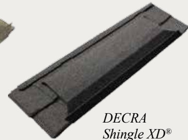
DECRA Shingle XD® Panel Vent