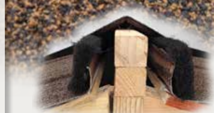
Installed with Center Beam