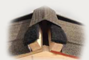
Installed without Center Beam